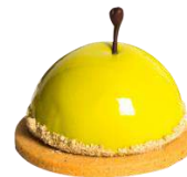
Apple Tart Tartin